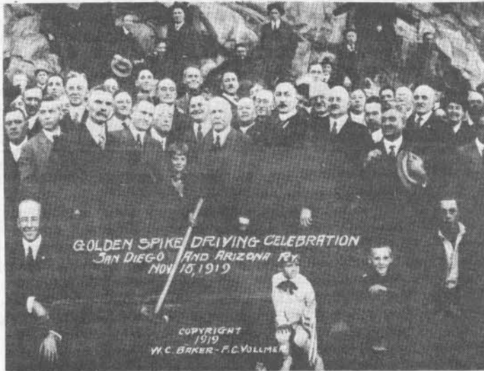
JOHN D. SPRECKELS is seen in the center of this photo of the spike-driving ceremony. The crowd consisted of the first 580 San Diegans to buy tickets at $7.50 each:

Nearly 600 passengers were aboard the train, it was estimated. Belated rush for tickets yesterday afternoon sent the sales to 580, and an extra coach was provided.