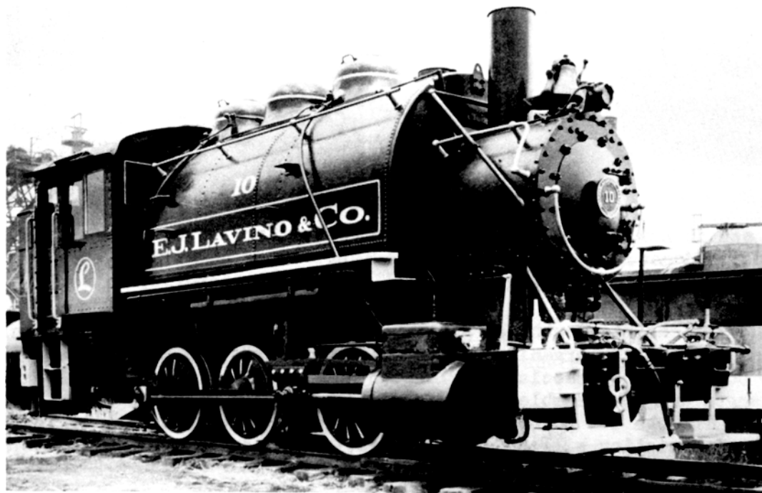
Steam Locomotive No. 10 - donated to the Museum by Owner E. J. Lavino and Company, Sheridan, Penna. It is an 0-6-0 (tank) coal burner built in 1923 by Alco.